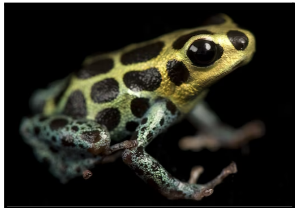
Above: An image of Ranitomeya imitator taken at National Aquarium in Baltimore, Maryland

Commonly referred to as the poison dart frog, Dendrobatidae are a genus of fairly common frogs in Central America or in Northern South America. The poison dart frogs are very colorful species, having a wide variety of colors spanning from green to purple, to even copper.