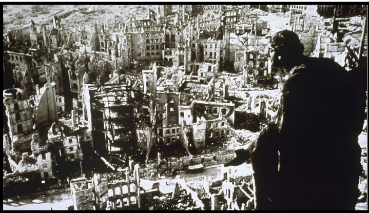
Above: In 1945, the city of Dresden stood in ruins.

According to reports published by the United States Government, Dresden was decided on as a strategic target because it was located near a Nazi communication center and rail transport. Dresden held more than 110 Nazi factories and over 50,000 pro-German workers. People who justify the attacks point to the fact that infrastructure such as bridges and industrial buildings that were not war-affiliated were not targeted, meaning that the grounds behind the attacks were only to take out the locations that were used by Nazi forces.