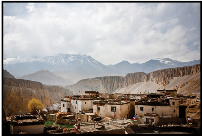
Above: An image of the isolated Kingdom of Lo

One particular kingdom in the Himalayas is an example of this architectural and cultural loss. Nearly a millennium’s worth of this nation’s historical, architectural, and artistic artifacts lie in the Kingdom of Lo. The Kingdom of Lo sits in the upper part of the Mustang District in Nepal which borders China and is surrounded by towering mountains all around. For centuries, Lo had a thriving trading economy and their monarchical leadership would fund the expensive preservation costs. This changed in 2006 when the Nepalese government faced a revolution, and banned all monarchies, resulting in the Kingdom of Lo losing power. The Nepalese government did not act on preserving the countless palaces, sculptures, paintings, documents and ancient riches which are now dissipating along with so much of the region's culture and history. The former King Jigme and current community leader of the Kingdom of Lo believes that tourism is the only way to maintain the physical history of Lo, starting with the first road connecting the isolated Kingdom to the rest of Nepal.