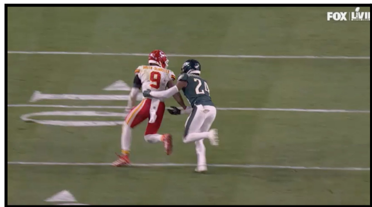
Above: The controversial holding call on 3rd & 8 which gave the Chiefs a first down and iced the game.